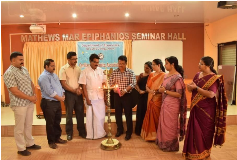
Inauguration of Economics Association

Economics Association, Ignite (Commerce Association), etc.—also improve the skills of the students.